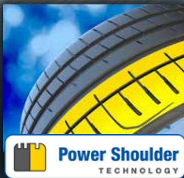
Power Shoulder TECHNOLOGY

The tire is constructed with a tread deformation protector to achieve better stability for high speed driving