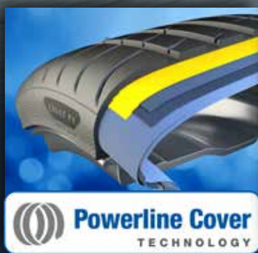
Powerline Cover TECHNOLOGY

Innovative compound and tread pattern design known as power zones to deliver superior handling performance for wet and dry roads