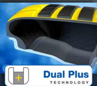
Dual Plus TECHNOLOGY

Innovative compound and tread pattern design known as power zones to deliver superior handling performance for wet and dry roads