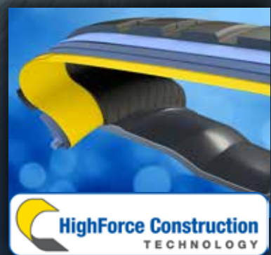
HighForce Construction TECHNOLOGY

With unique shoulder design to deliver more superior cornering performance